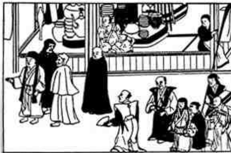
The Jesuits in Japan Japanese representation from the 16th century

Daimyo Nobunaga, sixteenth century military dictator of Japan, welcomed the Jesuit missionaries who came with the Western traders. Contrary to popular belief, when Japan first came into contact with the West she was eager for the interchange of ideas and commercial commodities. Nobunaga granted the Roman Catholics freedom to propagate their religion, donated them land in Kyoto and promised them a yearly allowance of money. Soon mission were established throughout the country and converts were mad by the thousands. Once this religious base was established, the Japanese rulers soon began to discover that the Vatican was also interested in political and military objectives. This led to confrontations and eventually open warfare. When the Jesuits were eventually driven from the land, Japan was closed to all Christian missionary work for centuries.