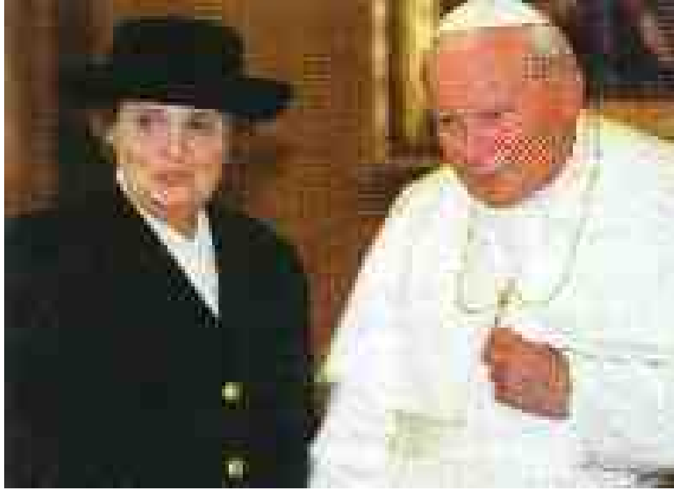
U.S. Secretary of State Madeleine Albright confers with Pope John Paul II in Vatican

This is just the latest chapter in a war that has been going on for over a millennia.