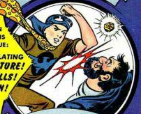
THE PHANTOM EAGLE

IN THIS ISSUE: SCINTILLATING ADVENTURE! THRILLS! FUN!