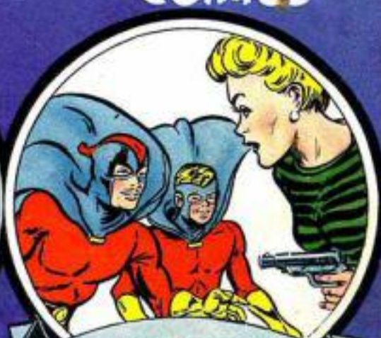
MR. SCARLET AND PINKY